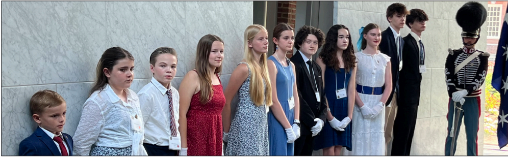
Bell tappers at practice