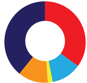
Operating Expenses for the Fiscal Year Ended April 30, 2024