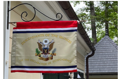
Flying the DSDI Flag page 5