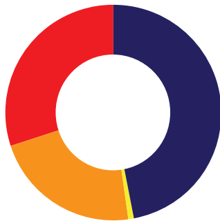
Assets as of April 30, 2024

DSDI operating expenses for the fiscal year ended April 30, 2024 were $119,927, resulting in an operating loss before investment results of $19,117. Together with net investment income and gains/losses on investments, net income was $116,299 for the period.