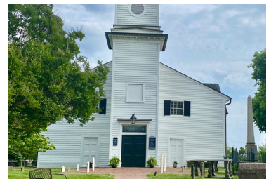
Commemorating the Revolution at St. John's Church page 8