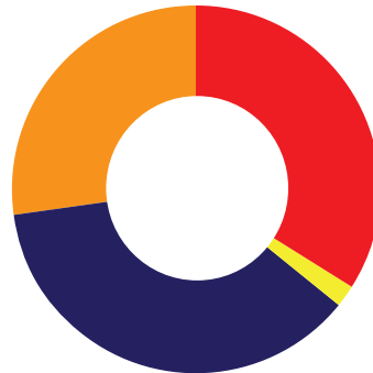
Operating Revenues for Fiscal Year Ended April 30, 2024